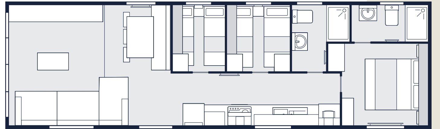
2. 41 ft x 12 ft 3 Bedrooms