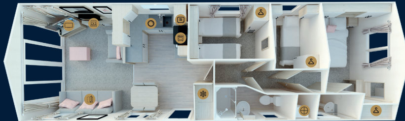
38 x 12 • 3 bedroom • sleeps 8