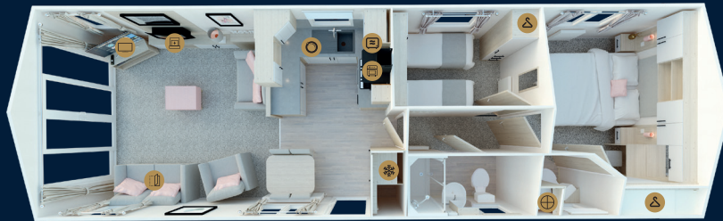
38 x 12 • 2 bedroom • sleeps 6