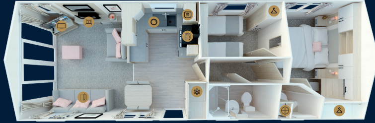
35 x 12 • 2 bedroom • sleeps 6